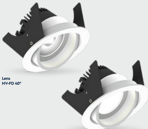
Lens HV-FD 40°